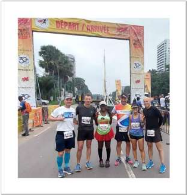
République Démocratique du Congo